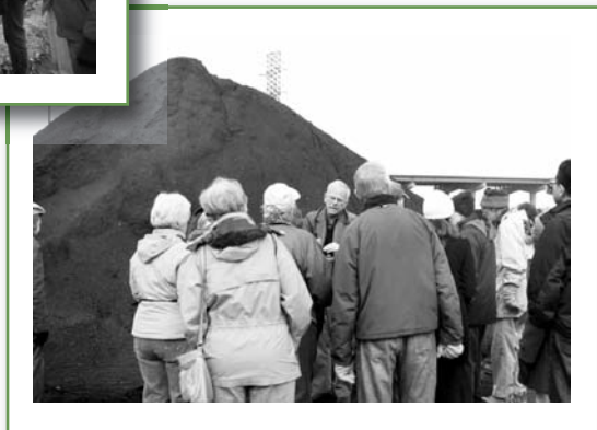
Examining the finished product